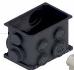
Foul Air Trap